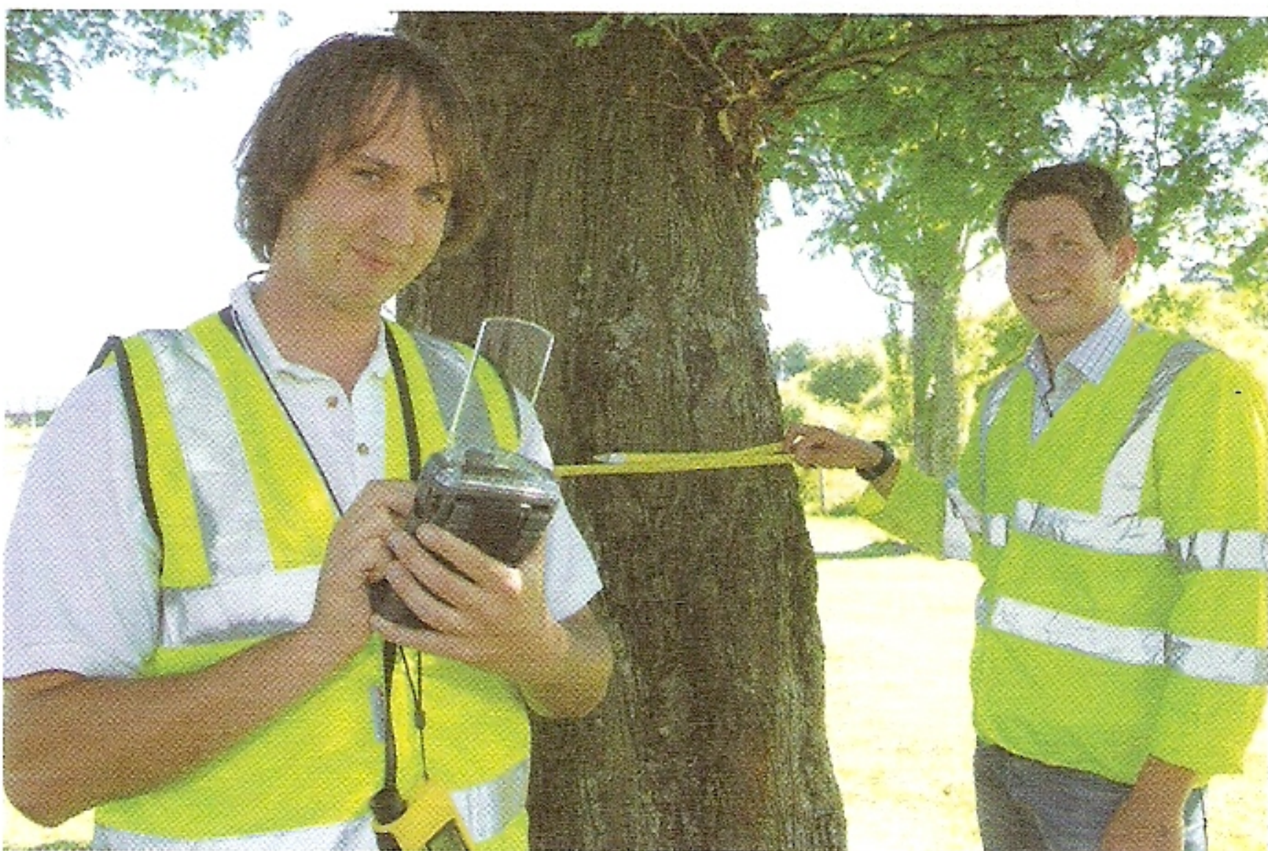
Ecosystem services can be defined as the services provided by the natural environment that benefit people

"The i-Tree applications can provide valuable information